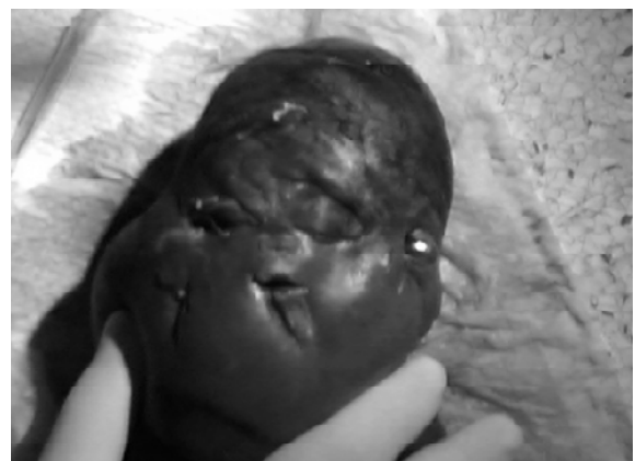
Figure 4: Photograph showing partially developed head and face.