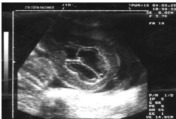
Figure 1: Transverse section through the acardiac twin with the level of the fetal head.

A 27 year-old woman, gravida 4, para 3; was referred to our institution at 23 weeks of gestation because of a twin pregnancy in which one fetus was suspected to be dead. Real-time ultrasound examination demonstrated monochorionic monoamniotic twin pregnancy with a single posterior placenta; twin A was in breech presentation with fetal measurements consistent with 23 weeks. No abnormalities were noted in this twin. Twin B, had no cardiac activity, had a large amorphus mass containing multiple cystic structures predominantly in the upper portion of the body and generalized edema. There was no evidence of a fetal head structure and of a central cardiac structure. Amniotic fluid volume was increased. (Figure 1) The diagnosis of a fetus acardius acephalus was made. The patient was admitted because of legal termination. Labour was induced by prostoglandin E1 analogs and 12 hours later twins were delivered. The normal twin weighed 600 gr and was a female. APGAR scores at one and five minutes were 1 and 0, respectively.