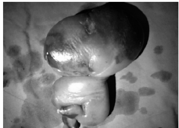
Figure 3: Photograph showing absence of the upper limbs. The lower limbs are developed.