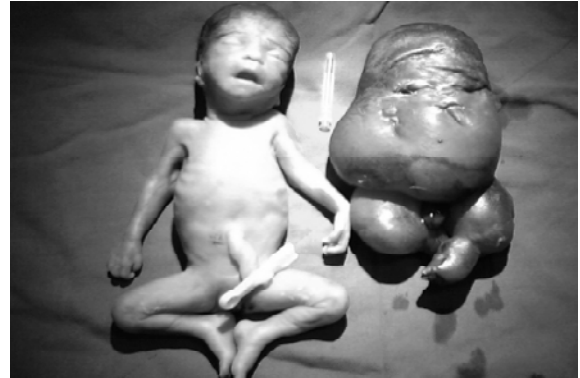
Figure 2: Photograph of the normal (pump) and the recipient twin.

The acardiac twin weighed 680 gr (Figure 2). Upper extremities were absent, the spine and pelvic bones are abnormal; lower limbs were apparent (Figure 3). Eyes were identified, in addition rudimentary ears, mouth and nose were present (Figure 4) and ambiguous genitalia (Figure 5) was observed. Skeleton deformation on X-ray is presented in Figure 6. Autopsy couldn't be done because the family were not give the permission for the autopsy.