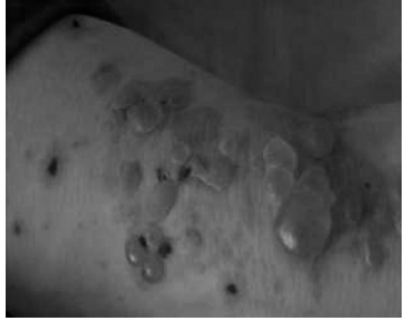
Figure 3: No improvement following corticosteroid therapy (antecubital area).

administration of the oral prednisone, a generalized bullous reaction ensued that spares the face, mucous membranes, and palms and soles (Figure 3, 4).