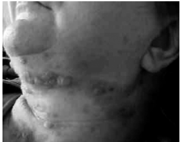
Figure 4: No improvement following corticosteroid therapy (neck)

Fluocortolone orally started and doses up to 60 mg daily administered. Doses regulated according to exacerbations and remissions throughout pregnancy. She delivered a viable infant at 35 weeks' gestation following preterm premature rupture of the membranes. She continued to have recurrent severe symptoms during the peripartum and postpartum period. The patient required hospitalization in dermatology department and high-dose corticosteroid treatment applied, until remission observed in postpartum 12th weeks.