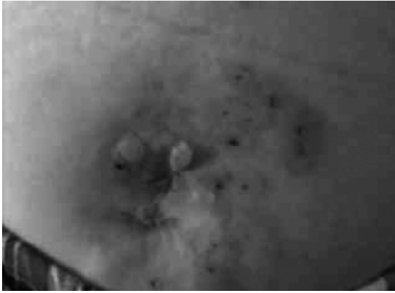
Figure 1: Abdominal lesions on presentation.

A 42-year-old woman (gravida six, parity three, abortion two) at 20 weeks' gestation presented with extremely pruritic, blistering skin eruption localized around the umbilicus (Figure 1) and vulva. In her obstetrical history, there were two spontaneous abortions, two vaginal births and one preterm birth in 34th weeks in which similar but mild eruptions occurred at the beginning of the third trimester. There were no other risk factors to explain the preterm birth.